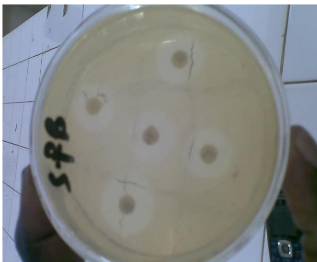
Fig. 3- Inhibition Zone of Salmonella Typhi with pure Standard antibiotic.