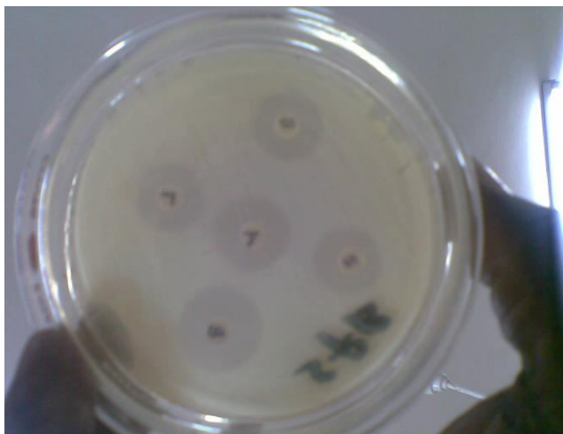
Fig 2- Inhibition Zone of Staphylococcus aureus with cefutil

rather than gram positive species like Staphylococcus aureus , 13 this result agreed with Susan et al., 15 and Kim et al. 14