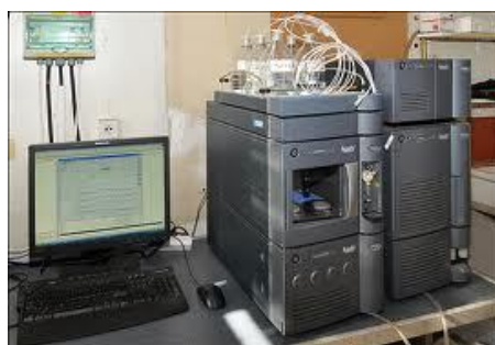
Figure 3: UPLC instrument