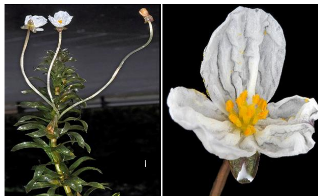
Figure 4 - H. verticillata flower

The flowers are imperfect depending on the two forms of Hydrilla presents. The monoecious type contains male and female on the same plants. The dioecious type contains only female per plants, generally found in US. Female flower (Figure. 4) consists of three whitish sepals and three petals each are 10-50 mm long and 4-8 mm wide attached at leaf axils and are lustered towards the lips of the stems from which female flowers arise are often very compact and have very short leaves. Where male flower Contains three whitish red or brown sepals each are 3 mm length and 2 mm wide having three stamens formed in leaf axils as they approach maturity these are released and float on the surface. 24, 25