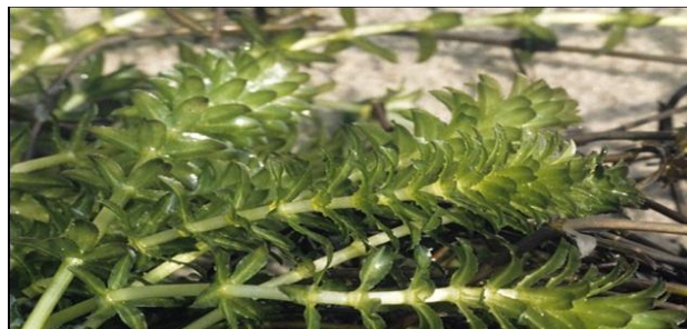
Figure 1 – Leaves of Hydrilla verticillata .

whorl of a spindle". Appropriately named, it is an aquatic plant with leaves that are whorled around the stem and belongs to the Frog's Bit family or Hydrocharitaceae. Some sources give a broad native range of parts of Asia, Africa and Australia. Some sources are more specific and say that the dioecious form of Hydrilla originated from the Indian subcontinent and the monoecious form originated from Korea. Hydrilla could easily be called the perfect aquatic plant because of the extensive adaptive attributes it possesses to survive in the aquatic habitat but it can grow in both static and flowing water including lakes, ponds, rivers, streams and reservoirs, and can survive few centimetres to 45 feet in depth in some parts of the country. It grows 2.5 cm in one day in fresh water.