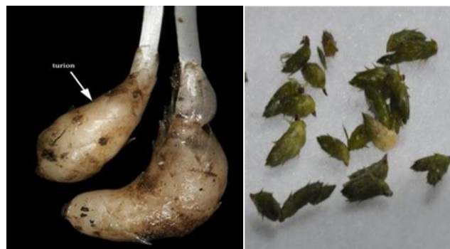
Figure 3 - Monoecious Hydrilla axillary turions

organic soil. Stems are only 1/32 of an inch wide; grow up to 30 feet length. The stem form branches when near the water’s surface, specially the monoecious form start to branch out at the sediment level. 23